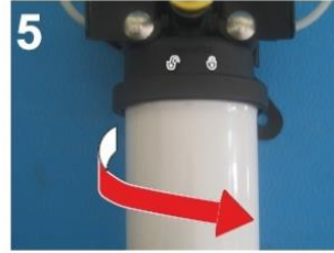
5 ROTATE THE FILTER CLOCKWISE UNTIL YOU HEAR A "CLICK"