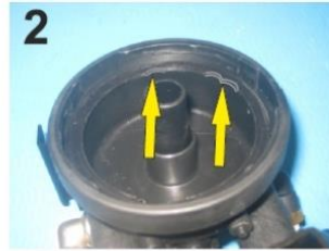
2 LOCATE ON THE MOUNTING BASE THE CUTS FOR THE SINGLE AND THE DOUBLE NOTCHES