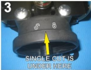
3 SINGLE CUT IS UNDER HERE LOCATE THE LOCK SYMBOLS ON THE MOUNTING BASE. THE SINGLE CUT IS LOCATED EXACTLY IN THE MIDDLE OF THE 2 LOCK SYMBOLS