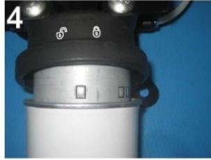
4 PLACE THE FILTER WITH THE SINGLE NOTCH TO BE BETWEEN THE 2 LOCK SYMBOLS AND PUSH UP